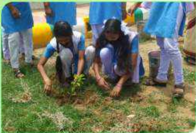
KANTAMAL GOVT. HIGH SCHOOL, KANTAMAL