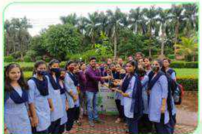
Gyana Bharati Institute of Science & Technology, Mancheswar, BBSR