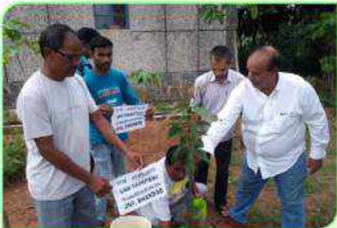
JAWAHAR NAVODAYA VIDYALAYA DHANBADJAWAHAR