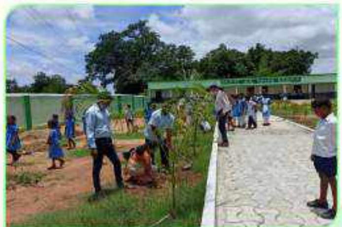
GOVT HIGH SCHOOL KULIHAMAL