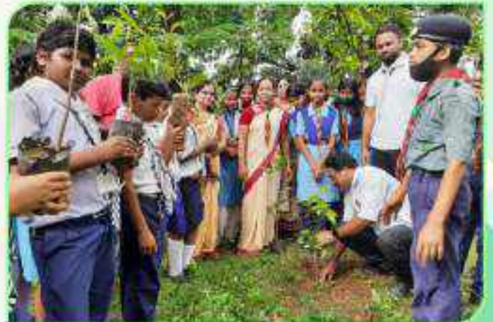
AJO Gout. High School Phulbani Kandhamal