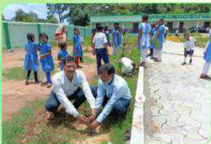
GOVT HIGH SCHOOL KULIHAMAL