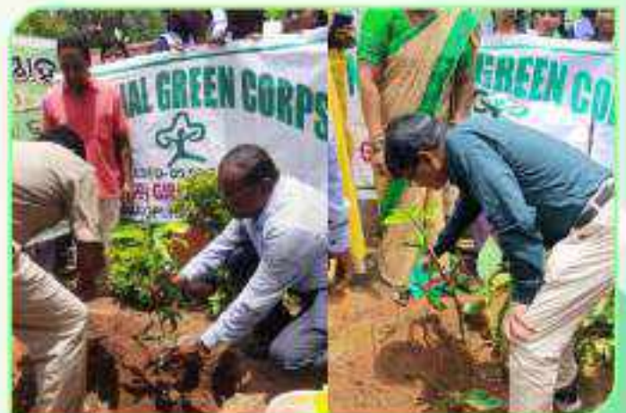
GOVT UPS PANDARIPATHAR JHARSUGUDA