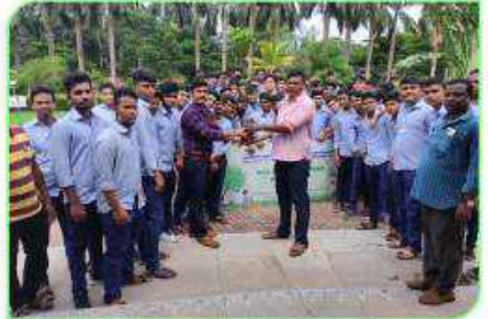
Gyana Bharati Institute of Science & Technology, Mancheswar, BBSR