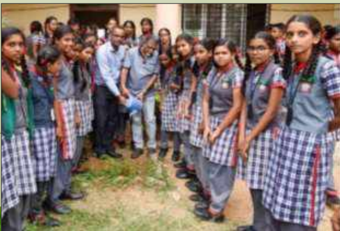
Plantation of Sapling