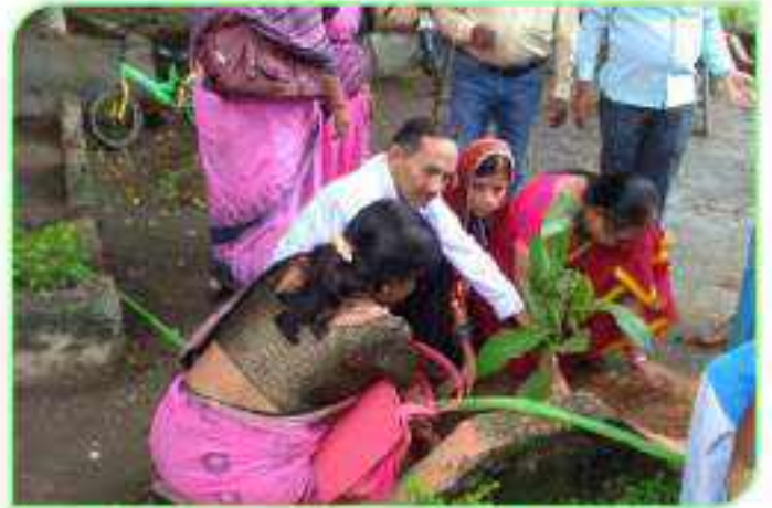
GOVT. UPPER PRIMARY SCHOOL BUROMAL APOST-JHARSUGUDA