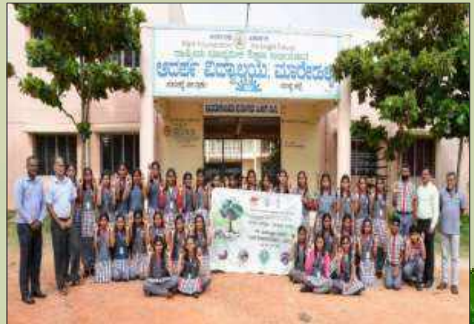
Seed Ball Distribution