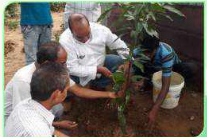
JAWAHAR NAVODAYA VIDYALAYA DHANBADJAWAHAR