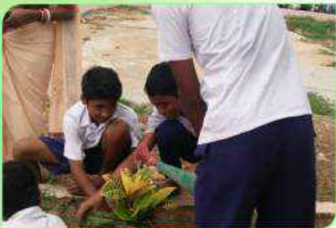
Denua Nodal High School Denua, Alipingal, Nimapara, dist-Puri