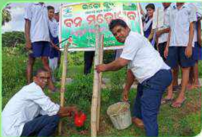
Bajrasuna Bidyapitha Balighai, Kendrapada