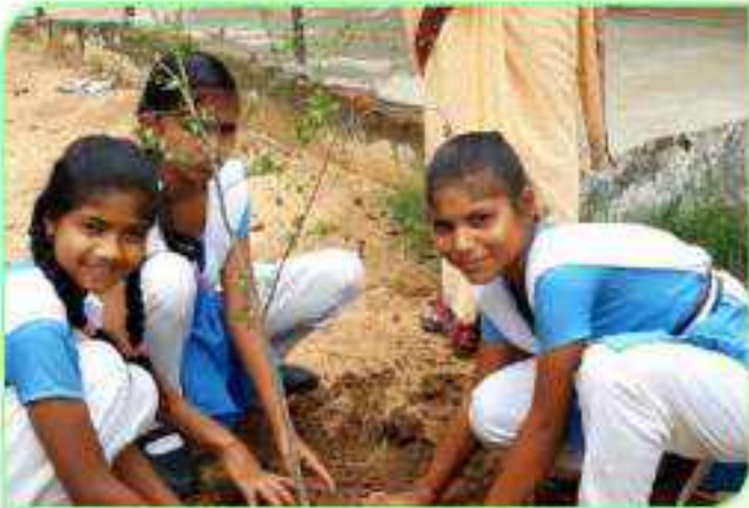
G. L. Govt High School Belpahar, Jharsuguda