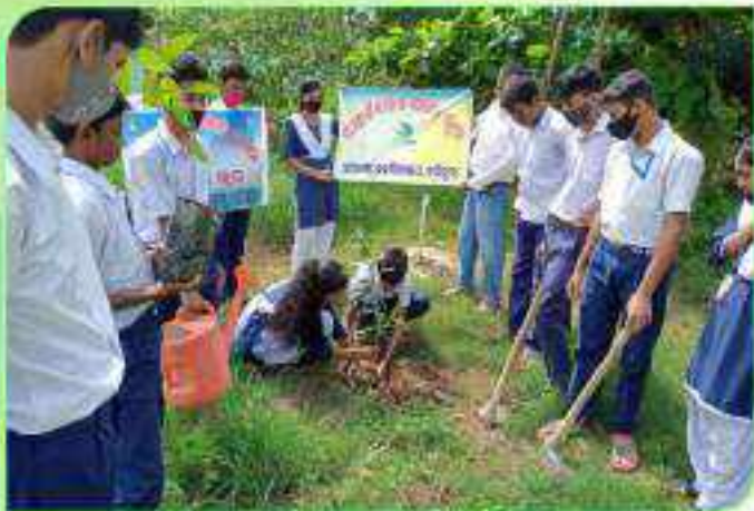
Gout High School Balikuda, Jagatsinghpur