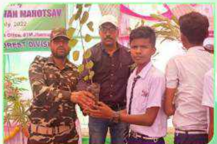
GOVT UPS PANDARIPATHAR