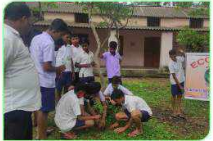
Bedapada Gout high school atpo- Bedapada, Hindol, Dhenkanal