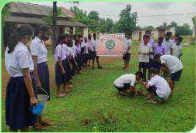
Bedapada Gout high school atpo- Bedapada, Hindol, Dhenkanal