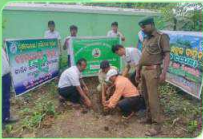
K. G High School Mahendragada Dist -Gajapati