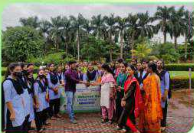
Gyana Bharati Institute of Science & Technology, Mancheswar, BBSR