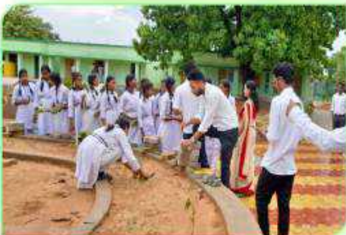
M.G.GOV.T.HIGH SCHOOL, KADAMDIHI, DIST-JHARSUGUDA