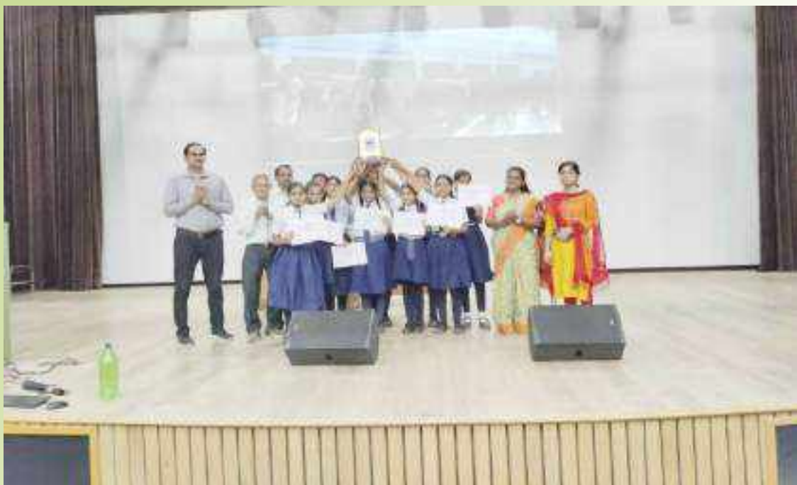
Winners of Street Play Competition