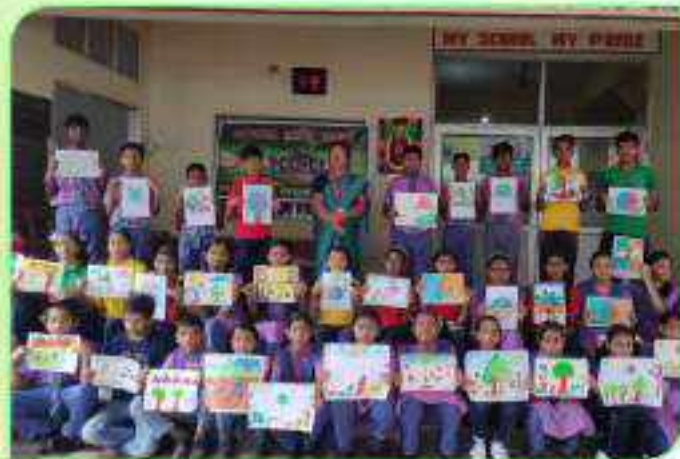
BALIKA VIDYALAYA KHETRAJPUR SAMBALPUR