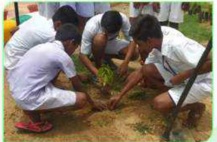
KANTAMAL GOVT. HIGH SCHOOL, KANTAMAL