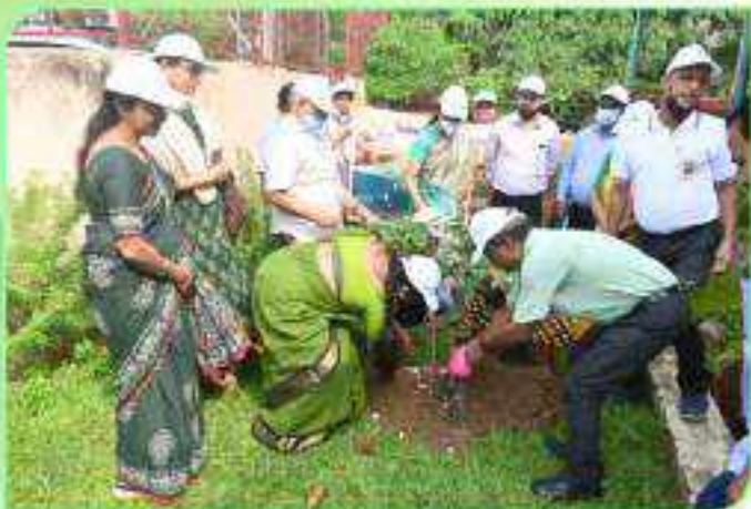
BJEM School Bhubaneswar, Khordha, Odisha