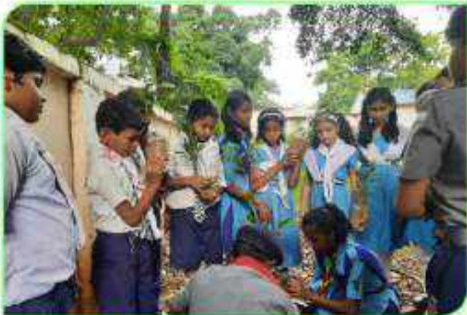
AJO Gout. High School Phulbani Kandhamal