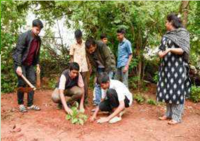
Plantation of Sapling