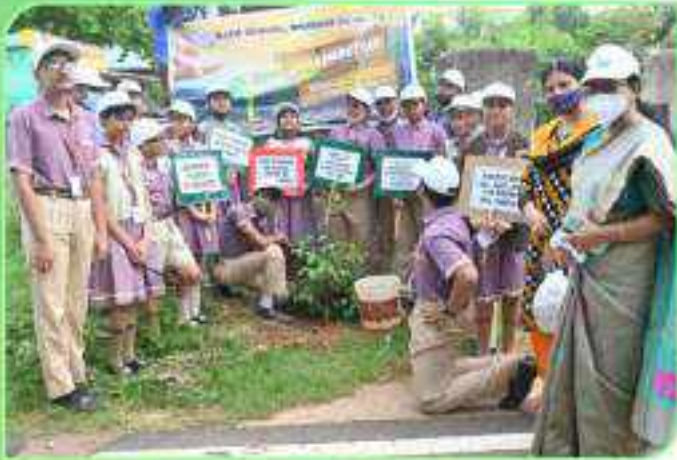
BJEM School Bhubaneswar, Khordha, Odisha