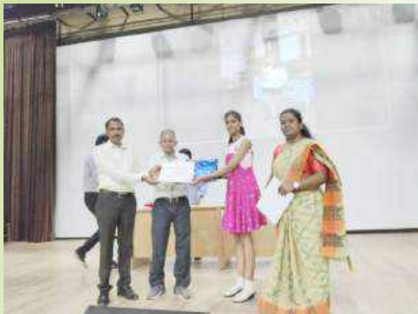
Winners of Poem Writing Competition