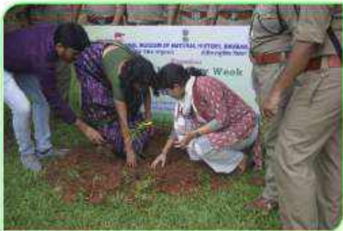
RANGERS OF FOREST DEPARTMENT ODISHA