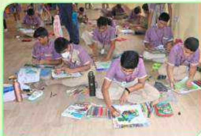
BJEM School Bhubaneswar, Odisha