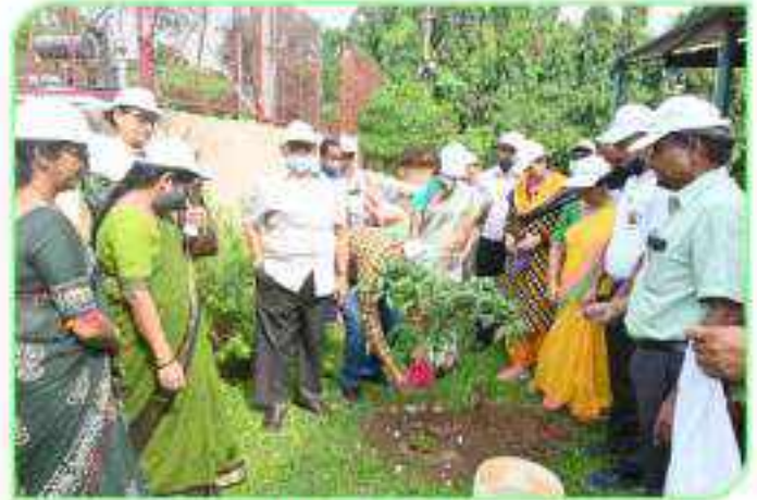
BJEM School Bhubaneswar, Khordha, Odisha