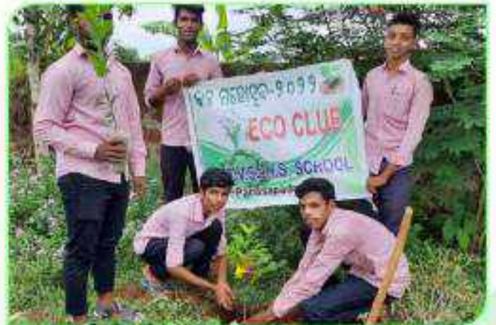
H.D.V.S.C.H.S School PANASAPADA, Puri