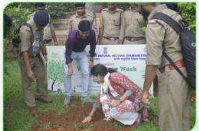
RANGERS OF FOREST DEPARTMENT ODISHA