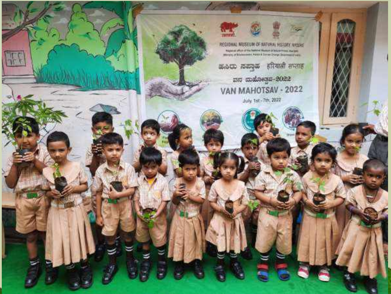
Distribution of Plant Saplings