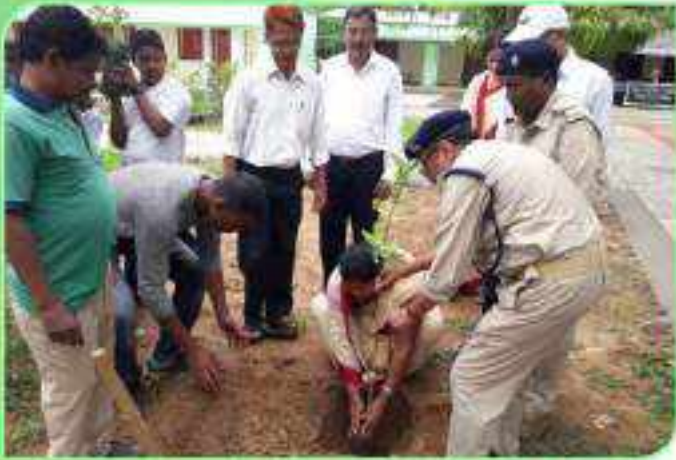
Govt Boys High School Kantabanji