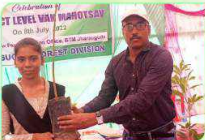
GOVT UPS PANDARIPATHAR