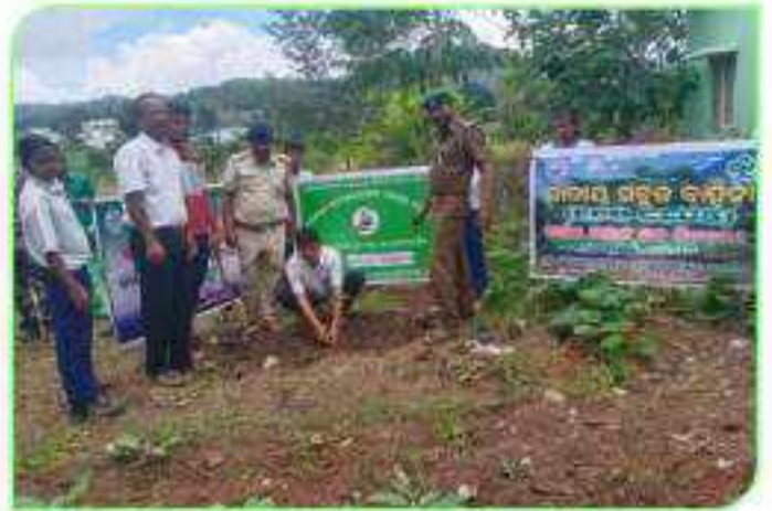
Gyana Bharati Institute of Science & Technology, Mancheswar, BBSR