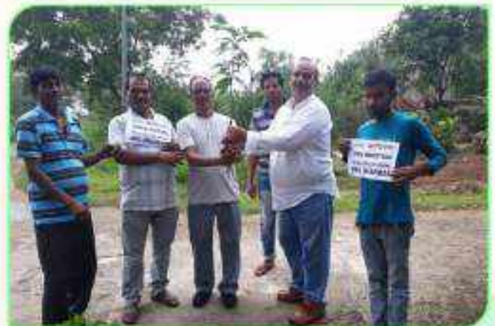
JAWAHAR NAVODAYA VIDYALAYA DHANBADJAWAHAR