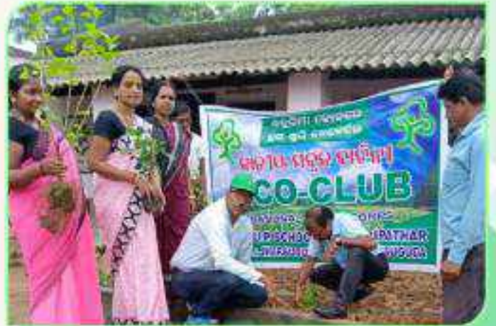
GOVT UPS PANDARIPATHAR JHARSUGUDA