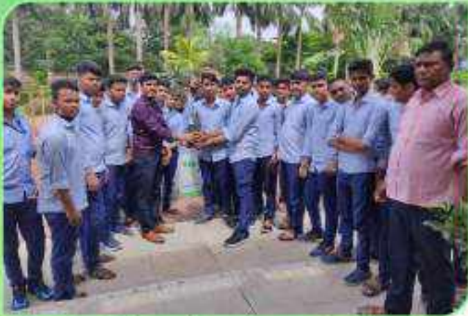
Gyana Bharati Institute of Science & Technology, Mancheswar, BBSR