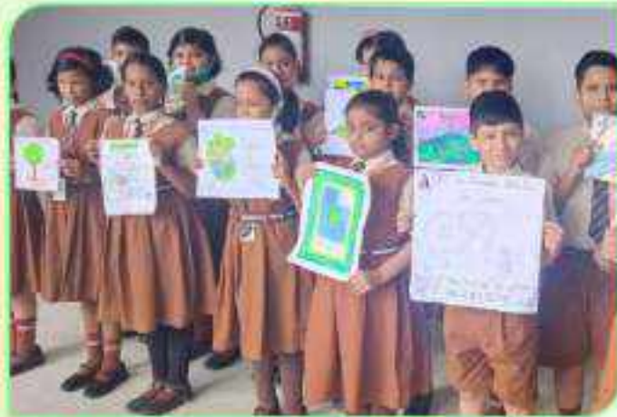
PRABHUJEE ENGLISH MEDIUM SCHOOL, VSS NAGAR, BHUBANESWAR