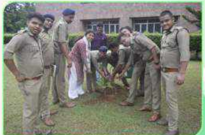
RANGERS OF FOREST DEPARTMENT ODISHA