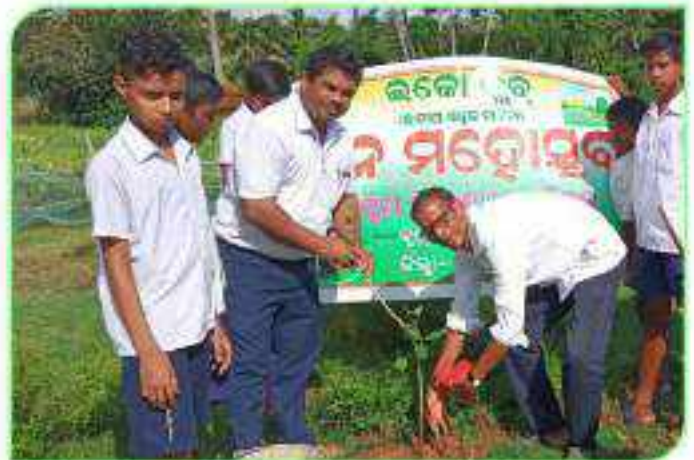
Bajrasuna Bidyapitha Balighai, Kendrapada